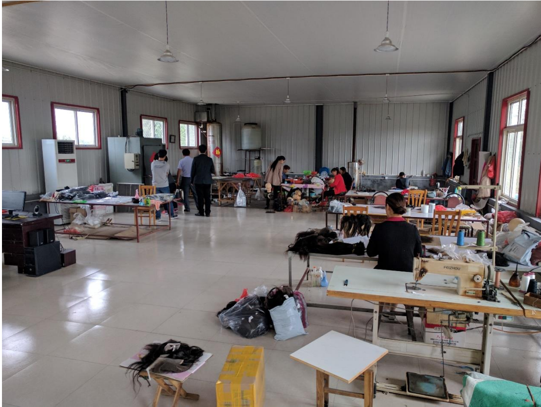
An example of 3rd tier factory I visited in China.

The other type of supplier in China is composed of trading companies. Trading companies don't produce anything. They simply source products from many different factories and perform some value-added services like quality inspection and shipment consolidation. Normally they add about 5% to the product cost (but at the same time, often they get lower prices than you may be able to get and so there's little or no price difference). Many blogs espouse that you must only deal with