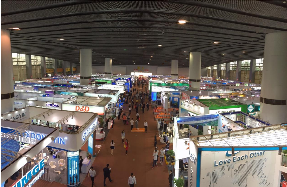
The twice-yearly Canton Fair is the Mecca of trade shows in China.

in his bedroom!) and you can buy one or two items at a time but at a much higher price.